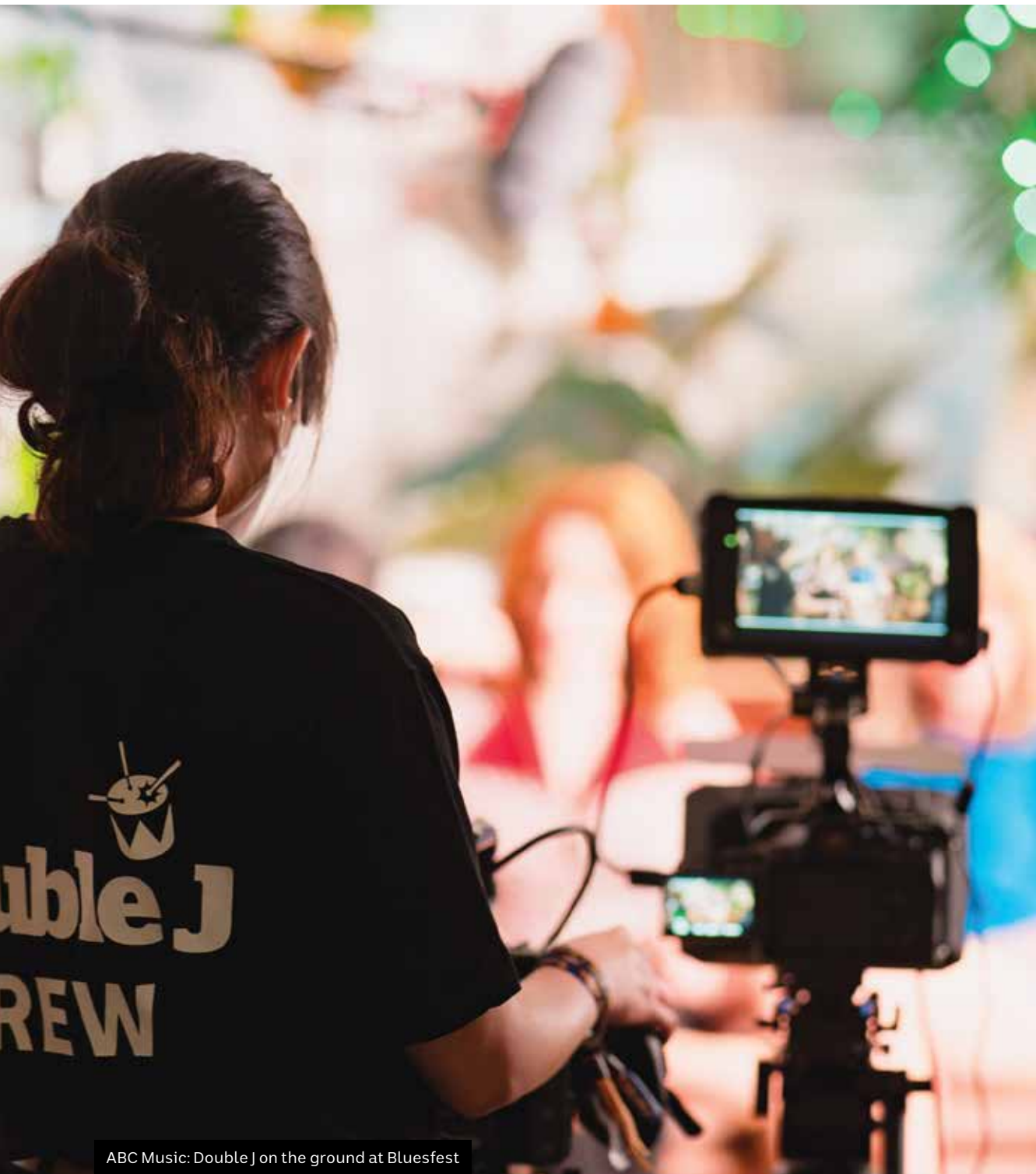
ABC Music: Double J on the ground at Bluesfest