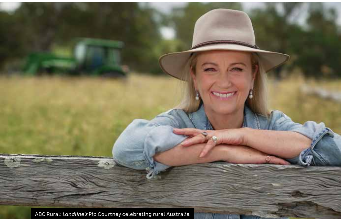
ABC Rural: Landline's Pip Courtney celebrating rural Australia