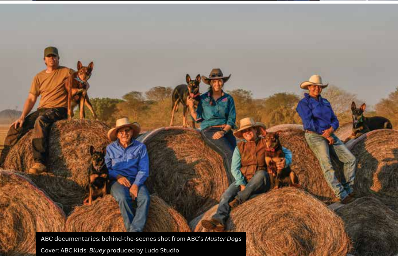
ABC documentaries: behind-the-scenes shot from ABC's Muster Dogs Cover: ABC Kids: Bluey produced by Ludo Studio